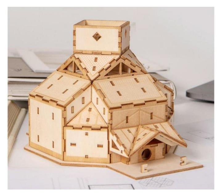
Figure 4 Wooden puzzle of Suzhou museum structure.