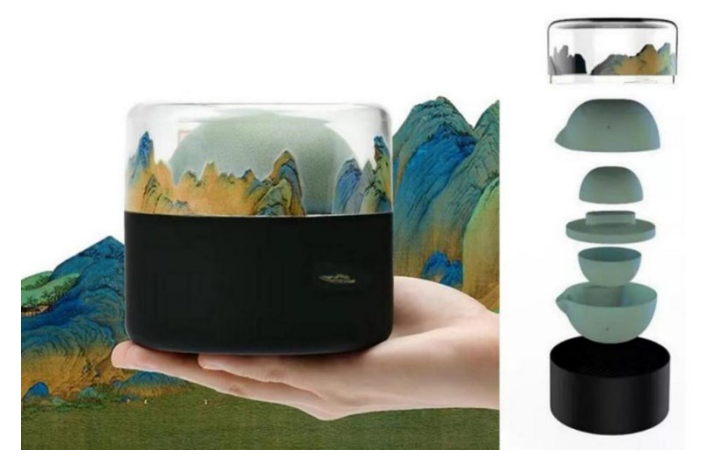
Figure 3 Portable tea set with the picture of a panorama of rivers and mountains.