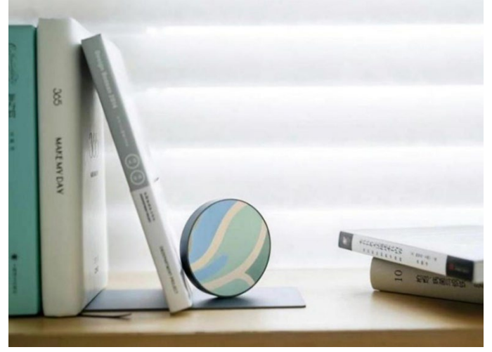
Figure 1 Tile bookend design.

through the angle of the book's opening, with three different lighting modes available that alternate between warm and cold color tones. Intriguingly, the book's pages contain fascinating views, intriguing quotations, and insightful theories by the great architectural master, Pei Leoh Ming, which are displayed when reading. The design of this piece is pleasing to the eye, and is convenient to store, serving both as a lamp and as a desk ornament, catering to nighttime lighting needs, while providing an artistic and exquisite atmosphere to daily life. Simultaneously, the design conveys the cultural spirit of architectural ideas and beliefs. It effectively demonstrates the integration of function and form to present cultural elements through the entries of a book, which, on one hand, retains the utility and user-friendliness of a lamp, and on the other hand, embodies the cultural aesthetics and quality of life.